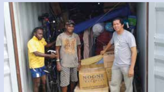
Unloading the container at Don Bosco Tetere

North Balwyn Rotary, in partnership with ASMOAF, have been supporting Don Bosco schools and the Salesian Sisters in the Solomon Islands for the past 14 years.