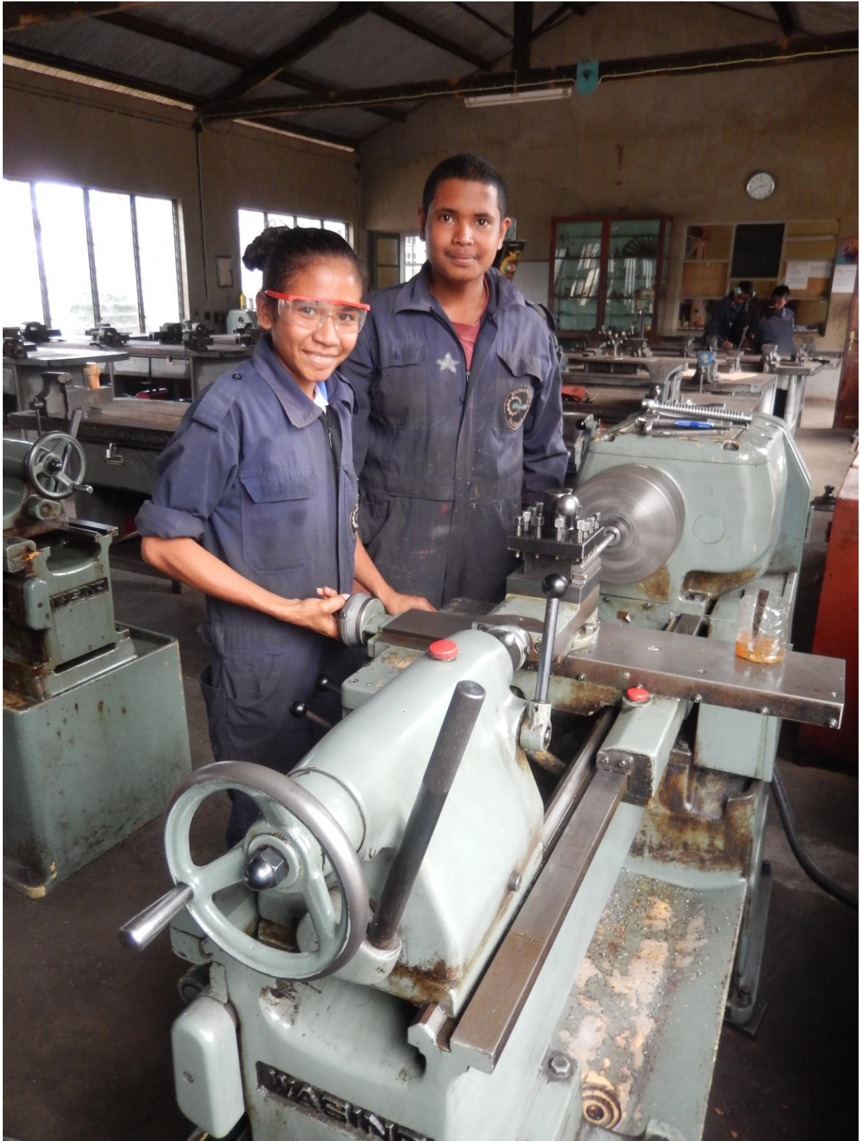
Students at Don Bosco Technical School, Fatumaca, Timor Leste (Oct 2015).