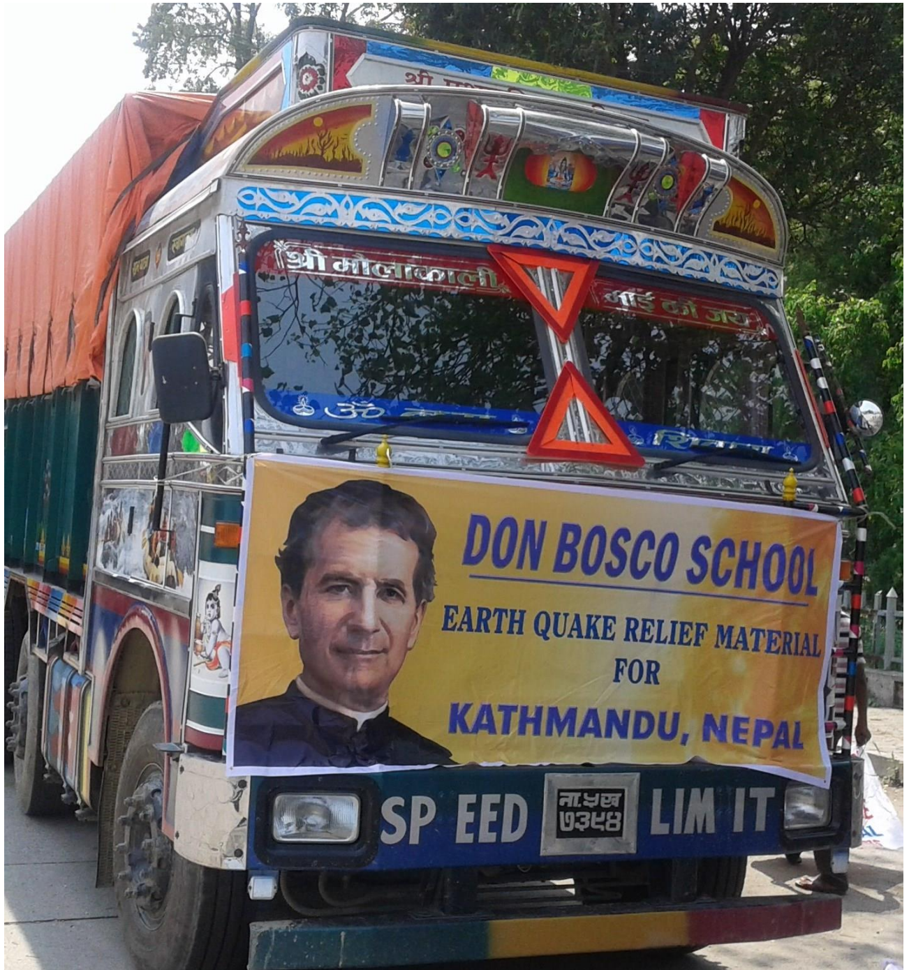
Earthquake Emergency Relief, Kathmandu, Nepal. (May 2015)