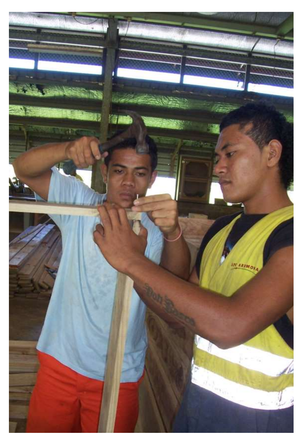
Carpentry students at Don Bosco Alafua, Samoa.